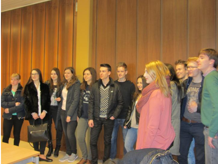
Visit at the School