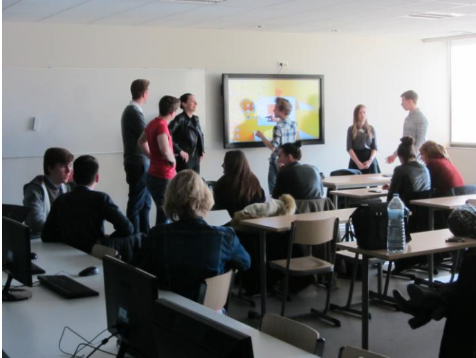
Presentation of project work